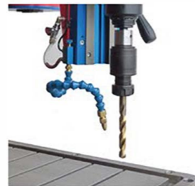
Tool cooling system

The Drilltronic can be supplied with an automatic lubrication system. With this system it is possible to ensure a correct and constant inflow of lubricating oil to the tool.